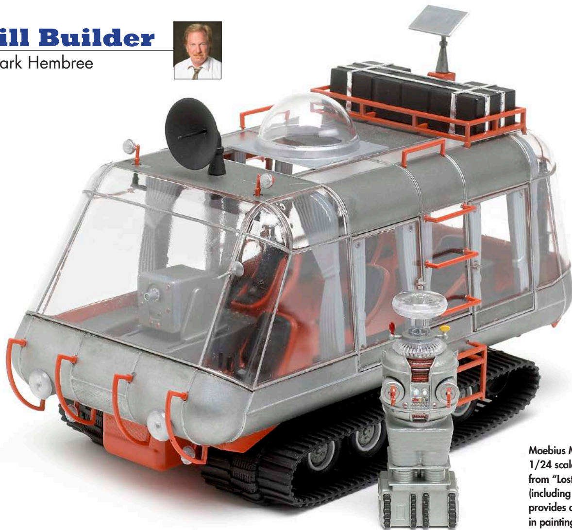
Moebius Models' 1/24 scale Chariot from "Lost in Space" (including Robot B9) provides a clear study in painting canopy frames.